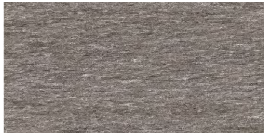
60x120 - 23 5/8 "x47 1/4 " EKW9 Anthracite 8 patterns