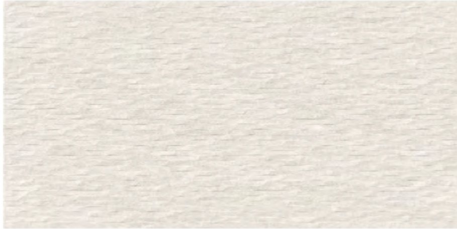
60x120 - 23 5/8 "x47 1/4 " EKW4 White 8 patterns