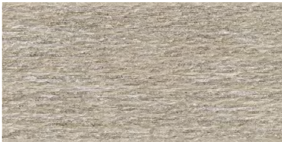
60x120 - 23 5/8 "x47 1/4 " EKW6 Greige 8 patterns