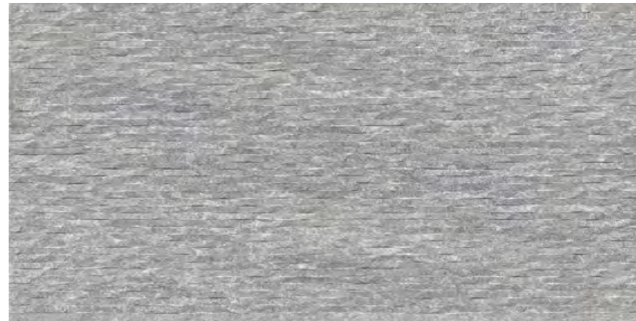
60x120 - 23 5/8 "x47 1/4 " EKW8 Sky Blue 8 patterns