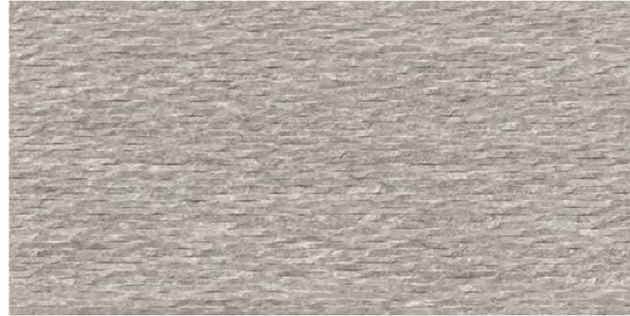
60x120 - 23 5/8 "x47 1/4 " EKW7 Grey 8 patterns