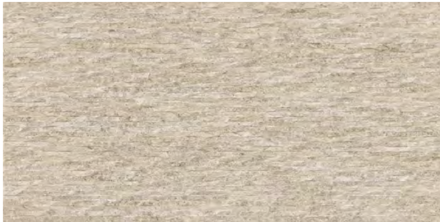
60x120 - 23 5/8 "x47 1/4 " EKW5 Sand 8 patterns